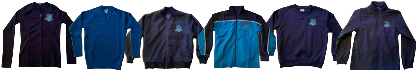
Girls Black Wool Blend Cardigan

All jackets and jumpers are allowed to be worn with School and Sports uniforms.