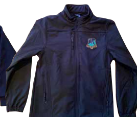
Black Softshell Jacket