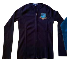
Girls Black Wool Blend Cardigan

All jackets and jumpers are allowed to be worn with School and Sports uniforms.