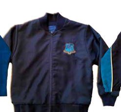
Black Bomber Jacket