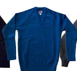
Boys Teal Wool Jumper