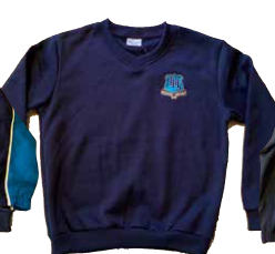
Black Fleecy Jumper