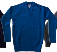
Boys Teal Wool Jumper