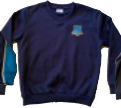
Black Fleecy Jumper