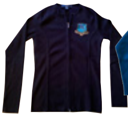
Girls Black Wool Blend Cardigan

All jackets and jumpers are allowed to be worn with School and Sports uniforms.