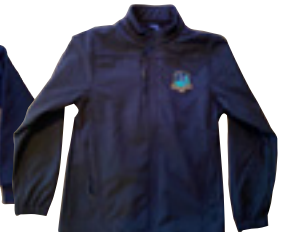
Black Softshell Jacket