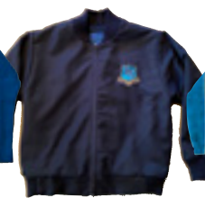
Black Bomber Jacket