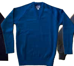
Boys Teal Wool Jumper