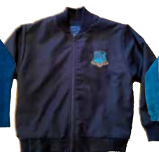
Black Bomber Jacket