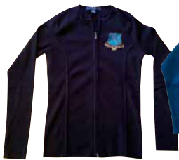
Girls Black Wool Blend Cardigan

All jackets and jumpers are allowed to be worn with School and Sports uniforms.