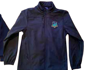
Black Softshell Jacket