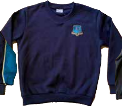
Black Fleecy Jumper